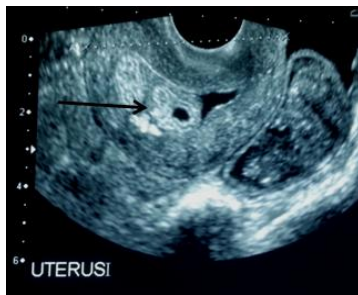
Figure 3: Longitudinal ultrasound scan showing tubular fluid-filled structure within the uterus (→).